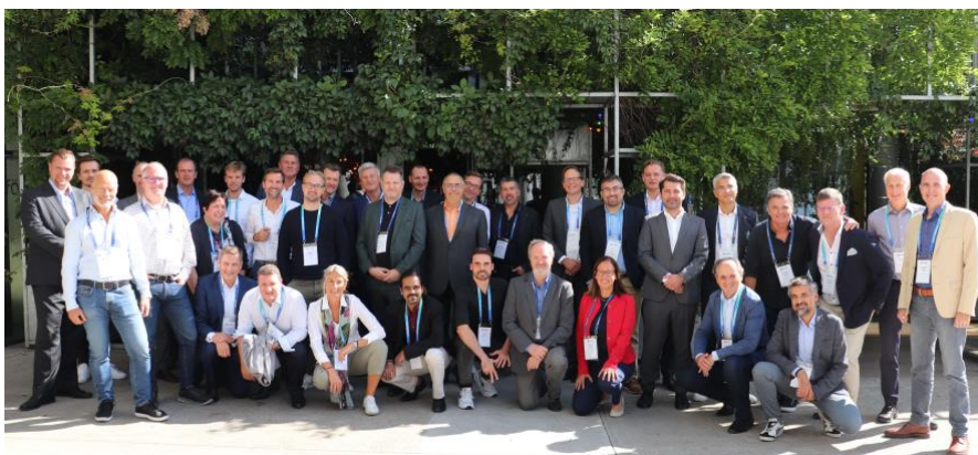
52nd EPSM Meeting in Zurich - 28 September 2023

To become a member, an endorsement by two EPSM members is necessary.